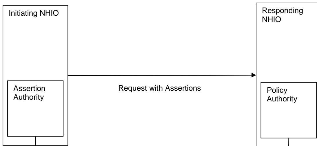
Figure 3.1-1 Interaction Behavior

The responding NHIO receives the request with assertions and consults a local Policy Authority or Policy Enforcement Point (which could be a SAML authority) to establish whether it should perform the function. Assertions can convey information about methods used to authenticate the user, user attributes, and authorization decisions about whether users are allowed to access certain resources. A single assertion may contain several different internal statements about authentication, authorization, and attributes. 2